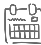
Managing my Money

You can find resources linked to each of these themes on the student activities page of the Sorted in Schools website . Click on Theme and select an option from the dropdown menu. The resources include booklets, powerpoints, infographics, videos, and interactive activities. You can search for different types of resources using the Media option.